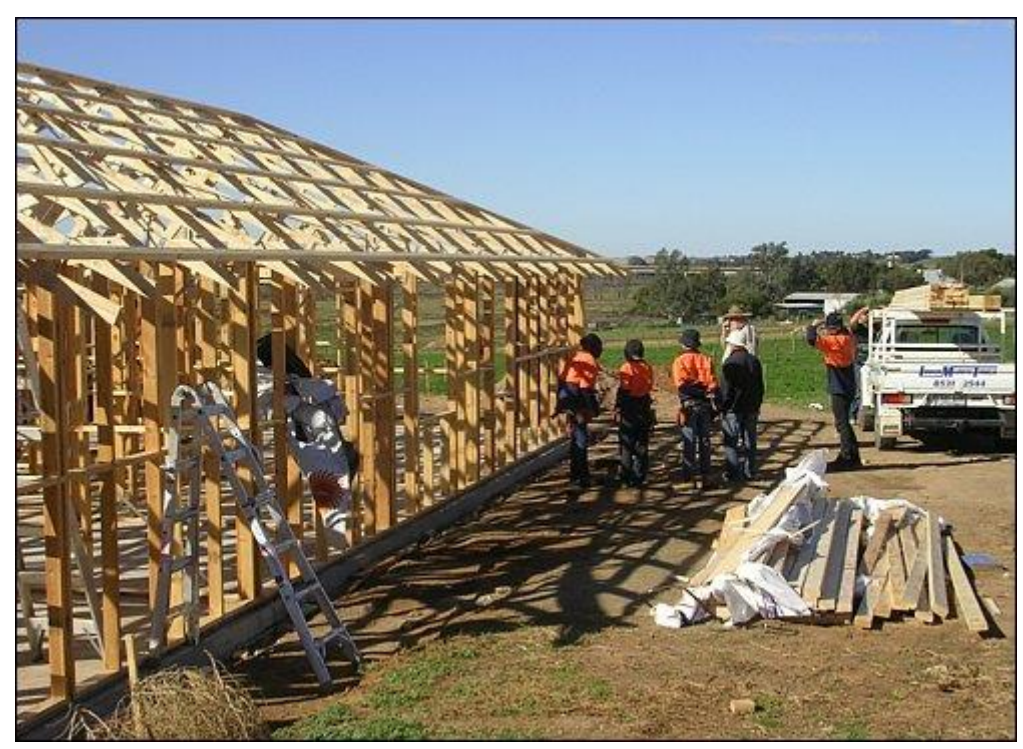
The images displayed on these pages show what youth can achieve given a chance.

Energy Education Australia's Murraylands Coordinator brought Habitat for Humanity to Murray Bridge for the 2012 build. The completed home with youth assistance was purchased by a family whose total combined income was not allowed to exceed $50,000. With assistance from Community Sector Bank, a not for profit arm of Bendigo/Adelaide Bank, a low mortgage was established.